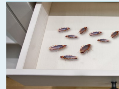
Cockroaches in Drawer